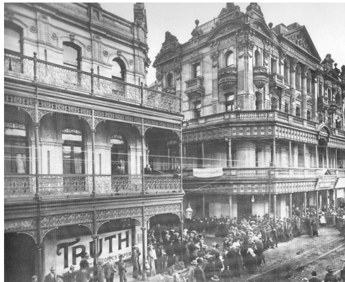
Four shops and His Majesty's Theatre-Hotel, Hay Street 1904-5 Austen, Tom, The Streets of Old Perth , p.69