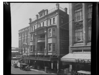
State Library of Western Australia