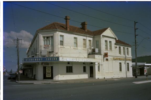
Claremont Hotel and 3 residential shops of 1901 ( Western Mail , 1 July 1937, p.14; Aug 1984 slwa_b3654729_2)