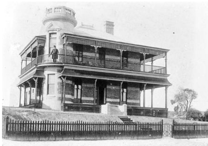
Bishop's Palace at Geraldton, built in 1900 for Bishop W.B. Kelly (Diocese of Geraldton)