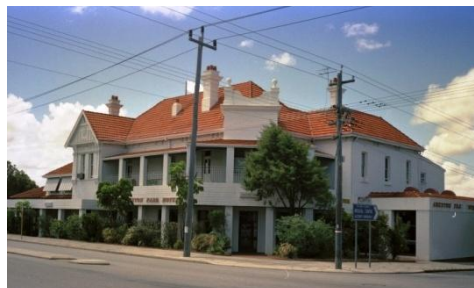
Shenton Park Hotel of 1907 (November 1985 slwa_b3699214_1)