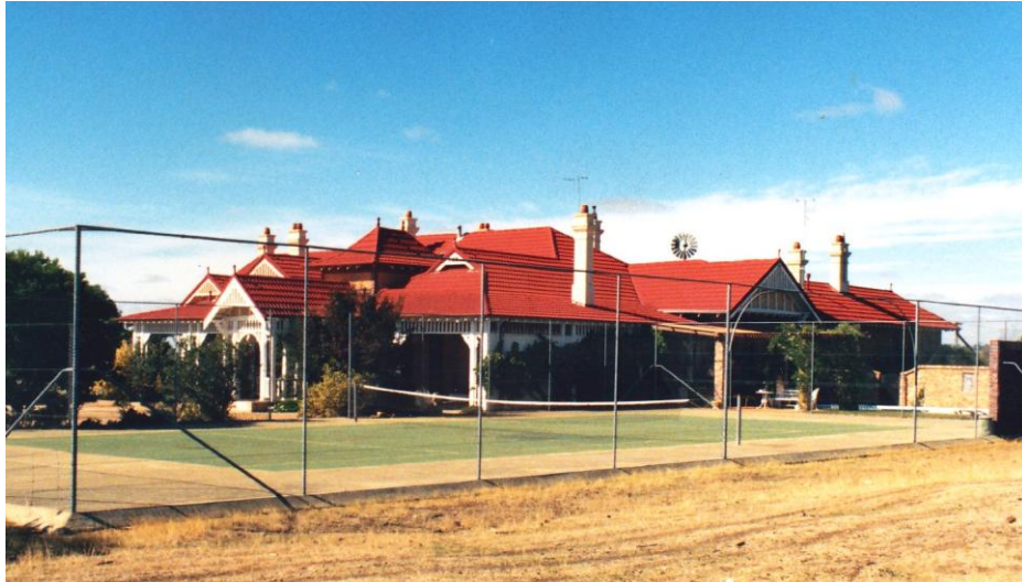
Hardie Family homestead Wallinar, Broomehill built in 1911.