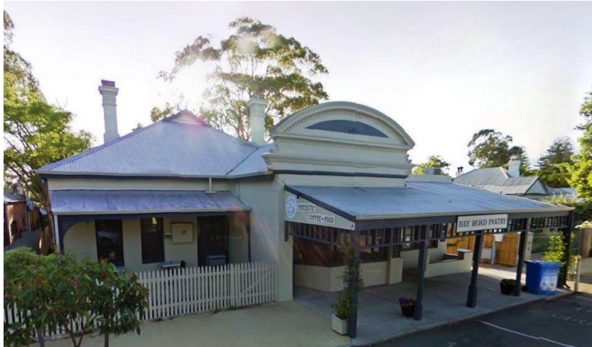
Shop-dwelling in Bay Road, Claremont WA of 1906, now Bay Road Pantry