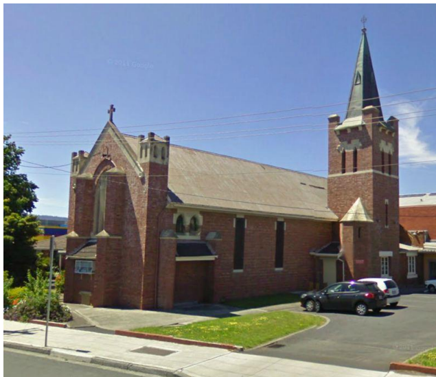
St Mary's Church, Springfield Avenue, Moonah, Tasmania of 1924 (Google 2012)