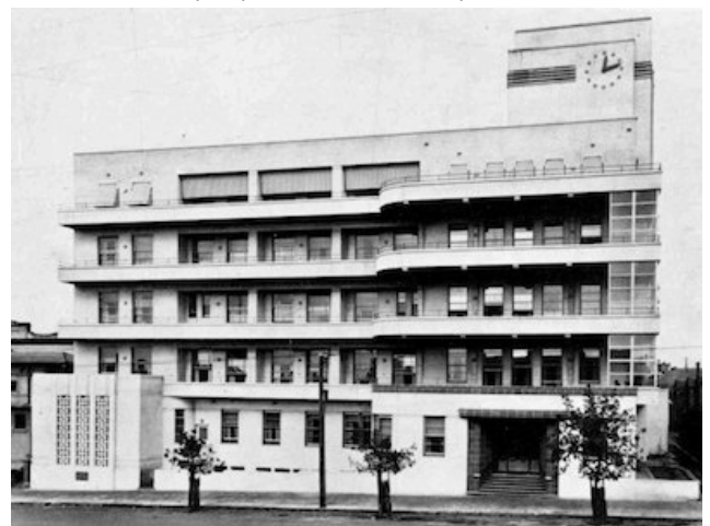
Shortly after completion in 1936, Aust. Architecture 1901-1951 , p139