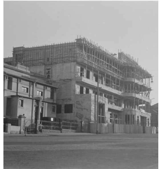
During construction 1934, photo by Lyle Fowler [SLV]