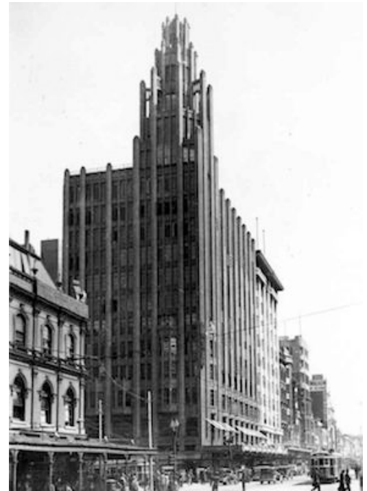
Swanston Street view in 1935, Rose Series [SLV]

Criteria Applicable N1 - Significant heritage value in demonstrating the principal characteristics of a particular class or period of design. N2 - Significant heritage value in exhibiting particular aesthetic characteristics. N5 - Having a special association with the life or works of an architect of significant importance in our history.