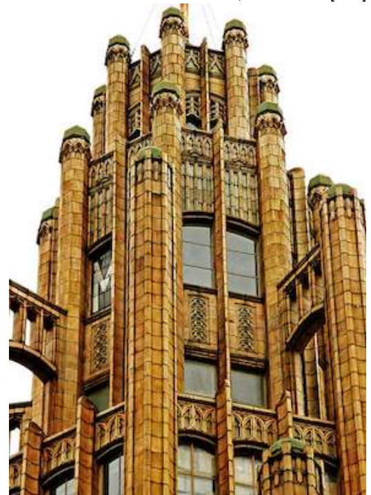
Tower detail 2008, photo by syam C [flickr.com]