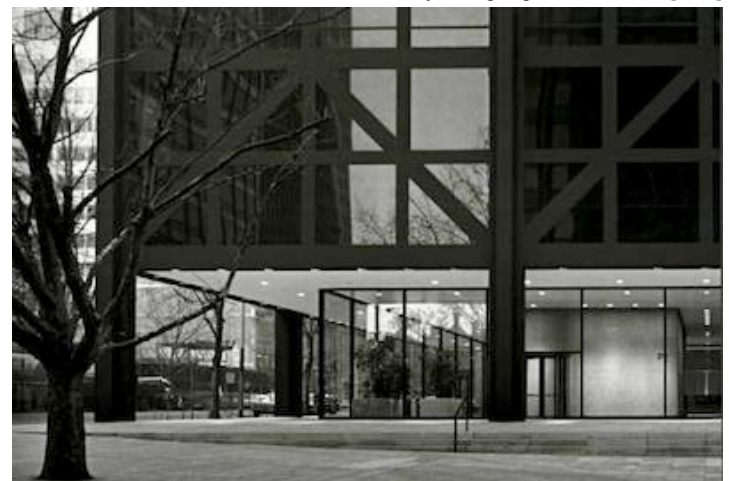
Plaza level & entrance foyer, photo by Wolfgang Severs, 1973 [NLA]