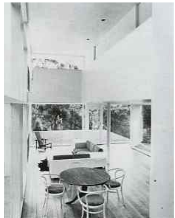
Interior view from stair overlooking dining & living areas