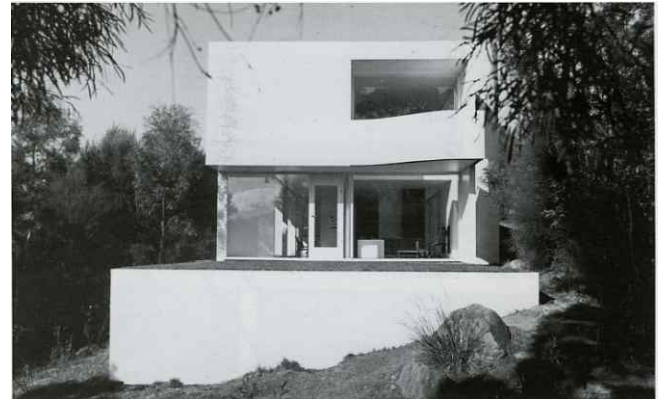
Exterior view from west

The Viney House is perhaps considered to be the best example of this architectural development and represents a highly refined critical approach to adopting international references that are transformed to the local landscape.