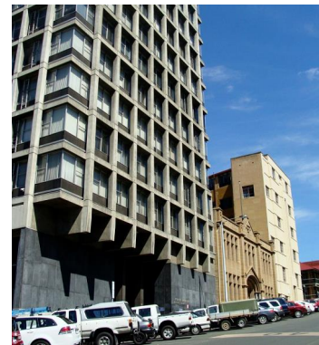
Entry, Murray Street.