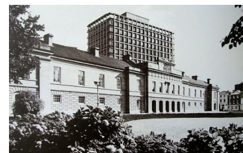
Parliament Square view