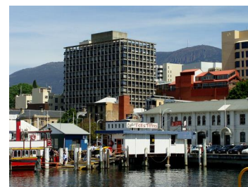
View from Sullivans Cove.