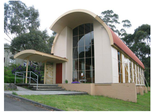
View from street

N5 Having a special association with the life or works of an architect of significant importance in our history.