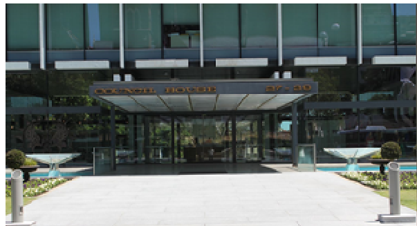
Philip Griffiths Architects 2010