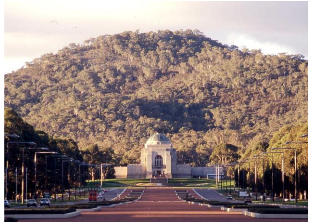
Australian War Memorial placed on Griffin's land axis, set below Mount Ainslie at the end of Anzac Parade.

Criteria Applicable N2. Significant heritage value in exhibiting particular aesthetic characteristics. N3. Significant heritage value in establishing a high degree of creative achievement.