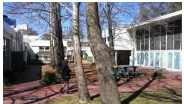
Paved Courtyard, 1981 additions. (Photo: Graeme Trickett c.2010).