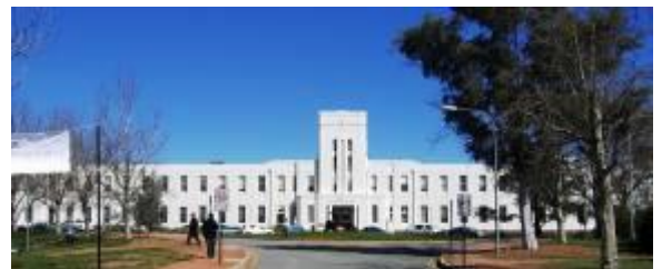
High School front façade.