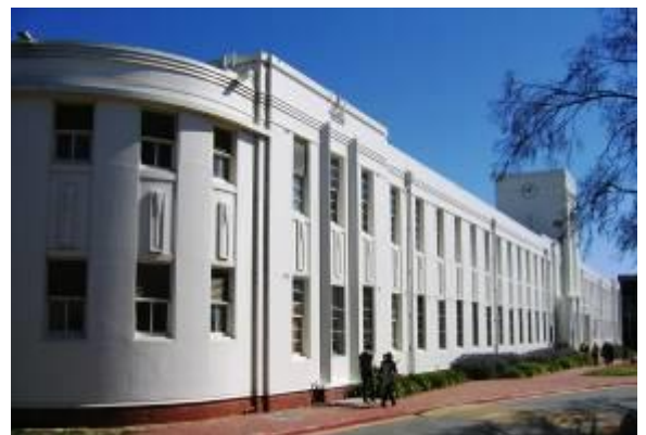
High School semicircular ends. (Photo: Graeme Trickett c.2010).