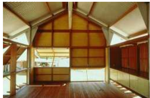
Internal view main living area