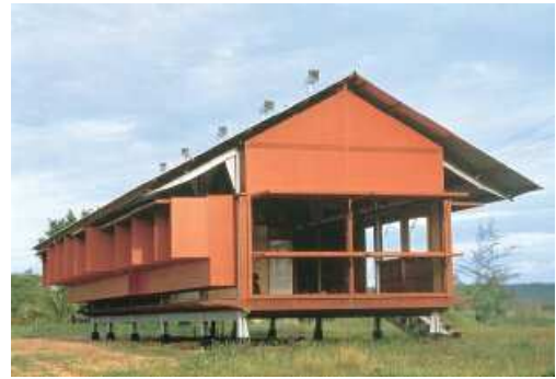
East end (facing community)

Criteria Applicable N1– Significant heritage value in demonstrating principal characteristics of a particular class or period of design. N2 – Significant heritage value in exhibiting particular aesthetic characteristics. N3 – Significant heritage value in establishing a high degree of creative achievement. N5 – Having a special association with the life or works of an architect of significant importance in our history.